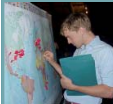
Learning opportunities abound at IC 2002.