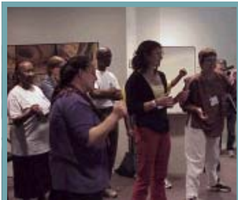
The South Africa team's performance in action