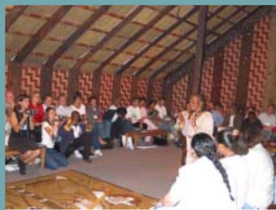
Opening in the Field Museum's Maori meeting room

with each person introducing him/herself by sharing something special from his/her own place or tradition, which makes community building possible. Many objects were brought forward and placed on a Dogon mud cloth from Mali in the center of the meeting house. They included a peace vessel from the Buddhist temple in Kathmandu, a candle brought by an Palestinian-Jewish team from Jerusalem, and a photo of Nelson Mandela. With gratitude, reverence and deep listening, the tone was set for the time together.