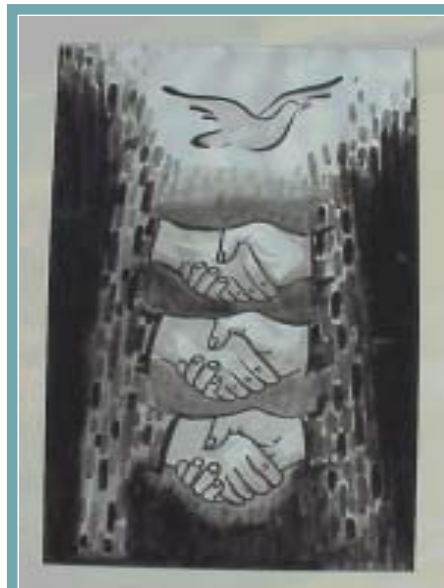
Imagine Nagaland's gift, Ladder of Peace

On the third morning, each participant received all of the notes from the first two days of sessions. Based on these, two last breakout rounds of 'action' issues were convened, which included launching a global imagination network, starting new and furthering existing Imagine projects, and utilizing Appreciative Inquiry in different forums. The closing circle invited comments from each participant. Two teams assembled mystery jigsaw puzzles made for the occasion which turned into images of a caterpillar and butterfly. Participants were each given a metamorphosis mug on which the caterpillar becomes the butterfly when a hot liquid is poured into the mug. The gift giving continued with the Imagine Nagaland team presenting Bliss a magnificent painting which captured the spirit of the celebration, the Ladder of Peace, painted by .