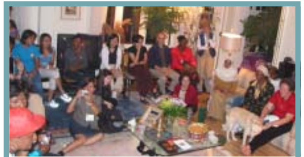
Wrapping up Imagination Celebration 2002 at Bliss' home

The final day was left open for tourist activities, and for informal consultations with Imagine Chicago staff. Many teams used the opportunity to talk through what they had learned and their plans for action. Participants returned home with "fire in their bellies", as the Mayor of Singapore put it in a thank you note-- full of new ideas for Imagination practices, tools to use, and a network of friends to contact for future support. An electronic infrastructure (a wiki website) has been put in place to support ongoing local-global learning exchange. The celebration continues!